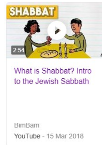
What is Shabbat? Intro to the Jewish Sabbath

https://www.youtube.com/watch?v=vjmiZWXXKFY