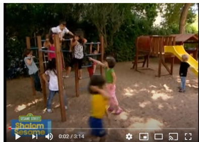
Shalom Sesame: Celebrating Shabbat

https://www.youtube.com/watch?v=k5UQXz_wHmQ